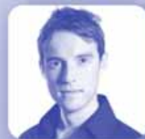
Sandy Newbigging Pioneer of the Mind Detox Method